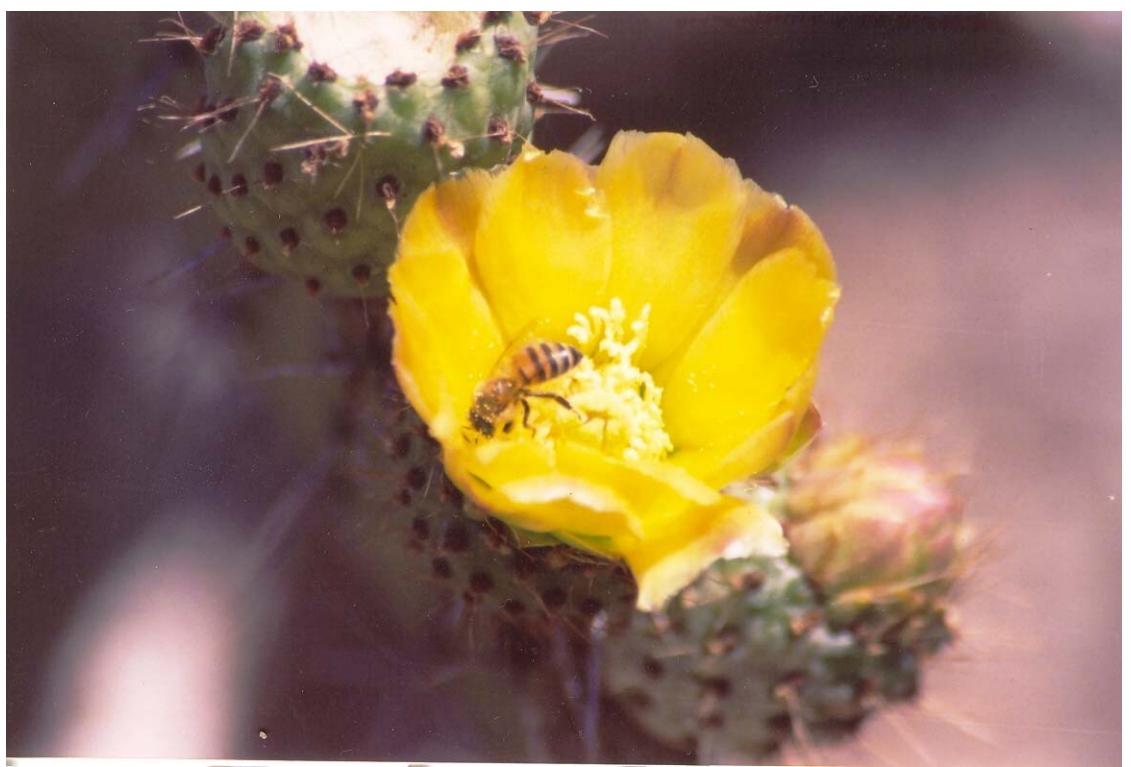
Figure 5. Apis mellifera visiting Opuntia streptacantha flowers in El Rayo, Zacatecas, population