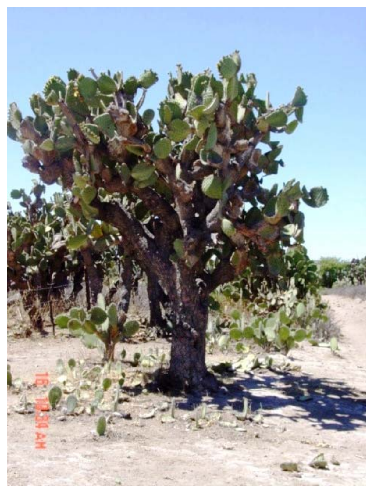
Figure 1. Mature plant of Opuntia streptacantha growing in an alluvial soil in a semiarid environment in the locality of El Rayo Pinos, Zacatecas