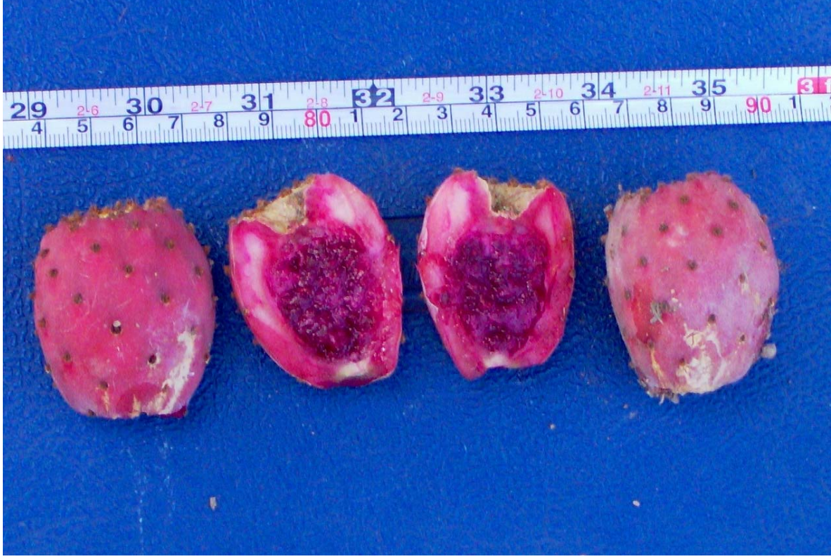
Figure 3. Mature fruit of Opuntia streptacantha