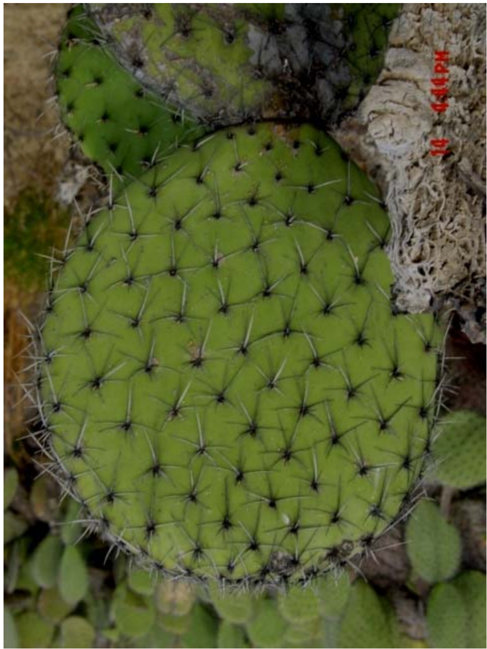
Figure 2. Morphology of mature cladode of Opuntia streptacantha