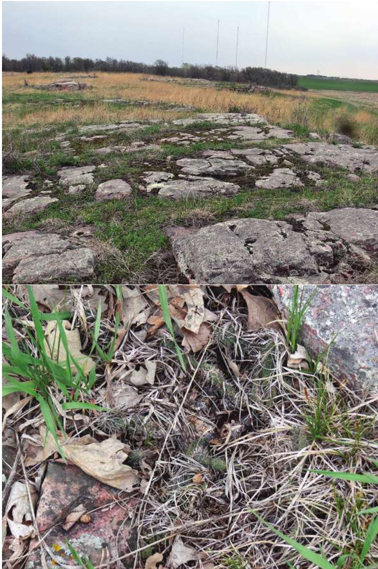
▲ TOP The Gitchie Manitou site is a long, low Sioux quartzite outcrop topped by a mosaic of rock, moss, and grass. BOTTOM Here several plants, still slightly dormant, compete with adjacent grasses for space. Larger clusters inhabit basins that have accumulated enough organic debris and water to grow moss, and prickly pears are often the only vascular plants in such situations.

We spread out, carefully searching for plants in and under the tangled stems of dead grass. At first we only discover a few, but gradually we find more and more, and eventually we identify 270 individuals. We count the pads on each plant, and also record appearances, classifying pads as alive, sick, dead, or etiolated (long and skinny). This population has had a hard winter. More than 20% of the pads, and 17 entire plants, have died. There are only 2.1 pads per plant (on average), and we don't find any of the large clusters I've come to