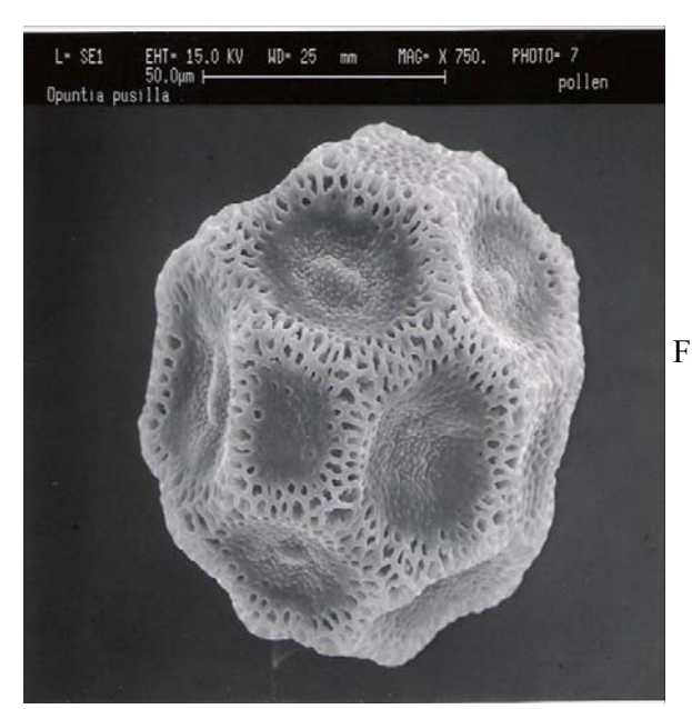
Fig. 3.3F-1. Opuntia pusilla pollen at 750' magnification.

Using standard scanning electron microscopy (SEM) techniques, the morphological differences among several species of Opuntia were studied. Slight differences were seen in the retrorse barbs of Opuntia affinis grandiflora , as compared to O. humifusa and O. pusilla . Aperture or quantity of pores and areoles on pollen surfaces were substantially greater in O. aff. grandiflora than in O. humifusa , O. pusilla , or a putative hybrid of the two (Figures 3.3F-1 through 3.3F-3). Minor differences in seed topology also were noticed among species. The arrangement of glochids produced from stem areoles was not readily distinguishable among species. It is anticipated that some of these microcharacteristics will prove useful in delimiting species of Opuntia .