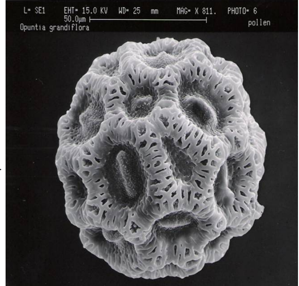
Fig. 3.3F-2. Opuntia affinis grandiflora pollen at 811' magnification.