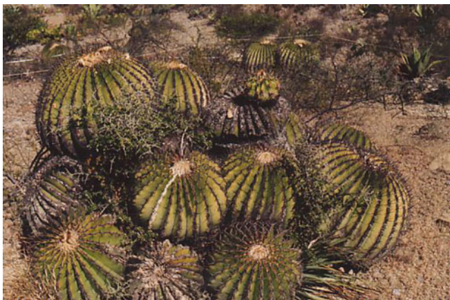
Fig. 2. Branched Echinocactus platyacanthus at Cecilia site, showing new branches emerging from damaged branches (November 1997).

Esparza) and from the literature. In order to understand how the artisanal production of acitrón affects the species, interviews were carried out with two families. Other families interviewed refused to provide any information because the use of this plant constitutes an illegal activity. In order to obtain information about plant extraction in wild populations, six people in each nearby town were interviewed. Local markets were visited at Puebla, Tehuacán, Querétaro, and Pachuca, in addition to the main market in México City ( Central de Abastos , the Central Wholesale Food Market), where six stall-keepers were interviewed to estimate the amount of acitrón sold.