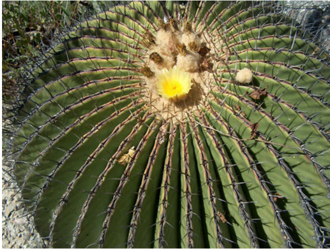
Fig. 1. Echinocactus platyacanthus with monopodial growth at the Cecilia site, showing one flower and mature fruits.

characteristics (density and the height of the stratum) of natural populations that sporadically are subject to illegal exploitation, and 3) to estimate the anthropogenic disturbance of its habitats. We anticipate a correlation between habitat disturbance and the status of E. platyacanthus populations (density, height, and percentage of damaged plants). If this correlation exists, then the index could be a good estimator of the state of the wild population of E. platyacanthus .