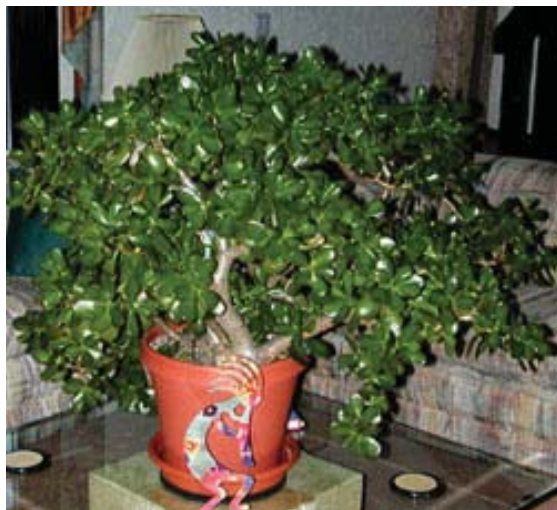
Jade plant is easily grown as a houseplant.

The plant has compact, rounded heads of pink flowers. The Khoi and other Africans used the roots for food, grated and cooked, eaten with thick milk. They also used the leaves for medicinal purposes.