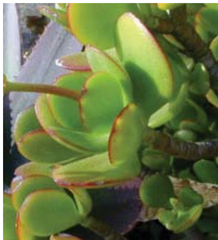
The rounded, fleshy leaves.

In its native habitat, C. ovata grows into a small rounded evergreen shrub (to 6 feet) on dry, rocky hillsides. It has many short, thick, succulent branches on a gnarled-looking trunk, suggesting great age even in young specimens. The bark peels from the trunk in horizontal brownish strips on old plants.