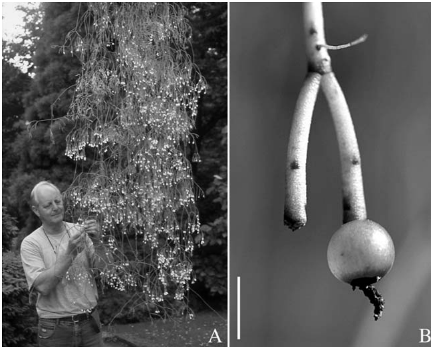
Fig. 2 Rhipsalis juengeri Barthlott and Taylor. (A) Habit of the flowering plant in cultivation. (B) Ripe, translucent-greenish fruit at the apex of a lower stem segment. Scale bar = 5 mm.

indicates that the scented fruits of R. juengeri have evolved from a group of bird-dispersed species with unscented fruits of conspicuous colouration.