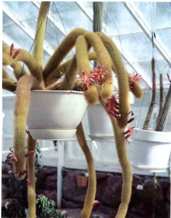
Borzicactus aureispinus adapts to a hanging pot at the Boyce Thompson Southwestern Arboretum. In its native Bolivia it hangs from sides of cliffs.

the very excellent retail plant nurseries present in Arizona and adjacent desert regions.