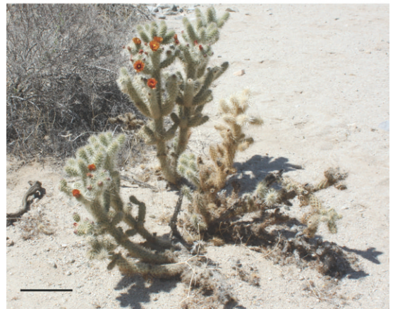
FIG. 3. Habit and habitat for Cylindropuntia chuckwallensis . Top image: M. A. Baker 17534; bottom image: M. A. Baker 17535, bar = 1 dm.