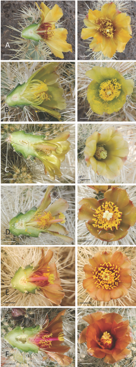
FIG. 2. Flower longitudinal sections (left images) and face views (right images) for: A., Cylindropuntia acanthocarpa (M. A. Baker 17541.1); B., C. echinocarpa (M. A. Baker 17531); C., pollen-sterile C. chuckwallensis (M. A. Baker 17534); pollen fertile D., C. chuckwallensis (M. A. Baker 17525.6); E., C. chuckwallensis (M. A. Baker 17525.7); F., C. chuckwallensis (M. A. Baker 17535), bar = 1 cm.

The mean values for each character from the morphological analysis were inserted into the formula, and the resulting values for only four characters of the hypothetical hybrid were well-aligned with those of C. chuckwallensis : branches per internode, central spine number, central spine thickness, and sheath thickness. The remaining nine characters were not a close match, which, combined with the occurrence of a pink style and gynodioecy, indicates that the origin of C. chuckwallensis is more complex than that of an allopolyploid of recent origin. Alternatively, the origin may be more recent and the genetic effects from hybridization not additive. However, non-additive genetic effects for morphological characters do not appear to be the normal situation in Cactaceae.