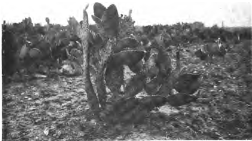
OPUNTIA DISCATA AND O. LINGUIFORMIS.