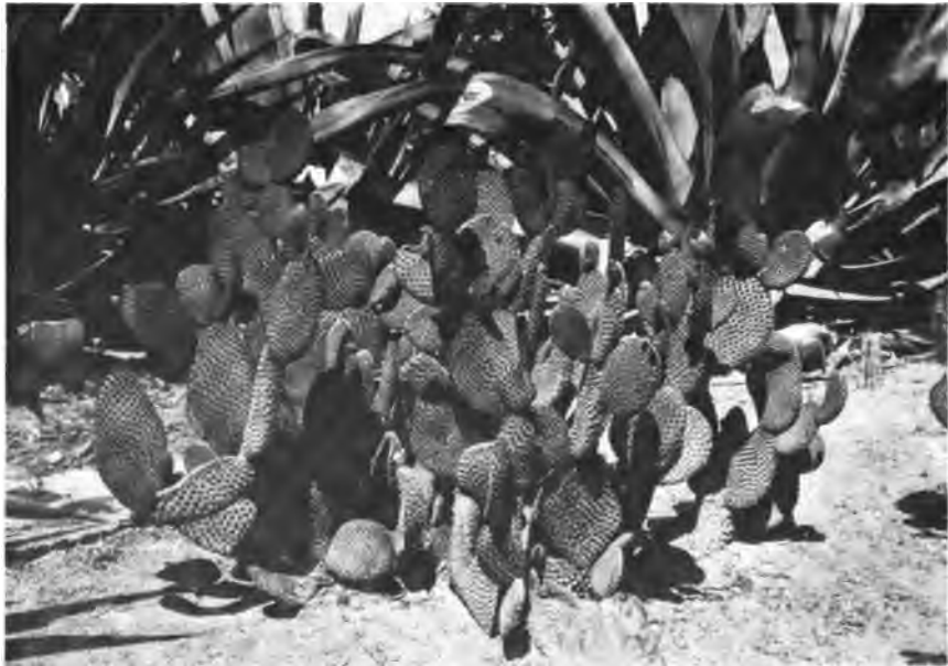
OPUNTIA MACROCALYX AND O. MICRODASYIS.