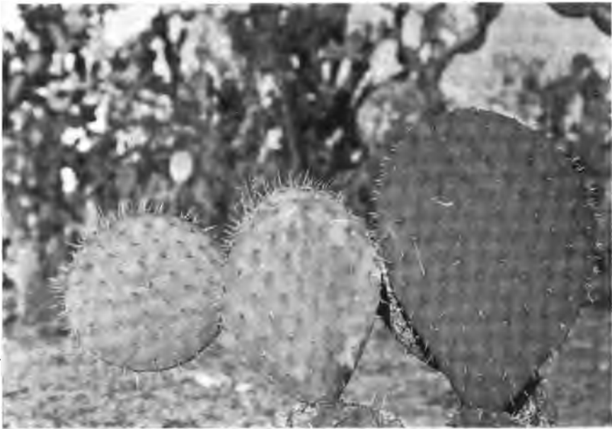
OPUNTIA FUSICAULIS, O. NEOARBUSCULA, O. CHAVEÑA.