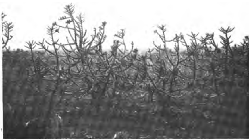
OPUNTIA CARDENCHE AND O. LEPTOCAULIS,