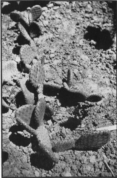
Opuntia aurea . Notice the flower between the two right extensions of joints.